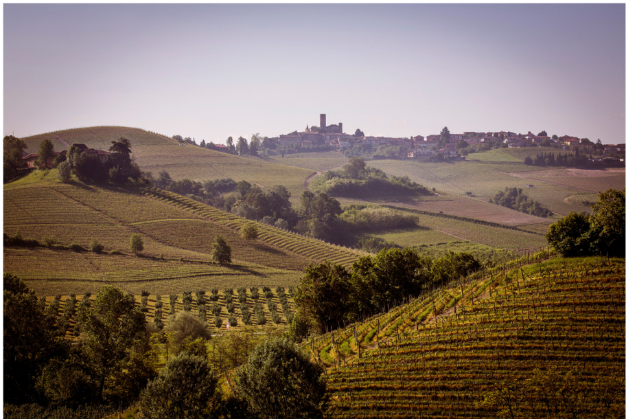
Fig. 1 Landscape of Langhe

in-depth interviews specifically addressing the mechanisms of transmission of TEK related to truffles were also conducted. Prior Informed Consent was always obtained before each interview and the Code of Ethics of the International Society of Ethnobiology was strictly followed [32]. The interviews were conducted in